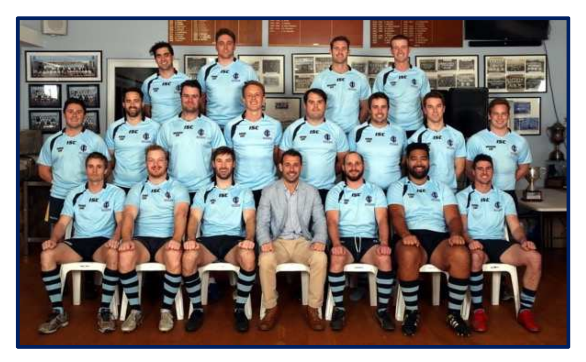
Burke Cup 2019