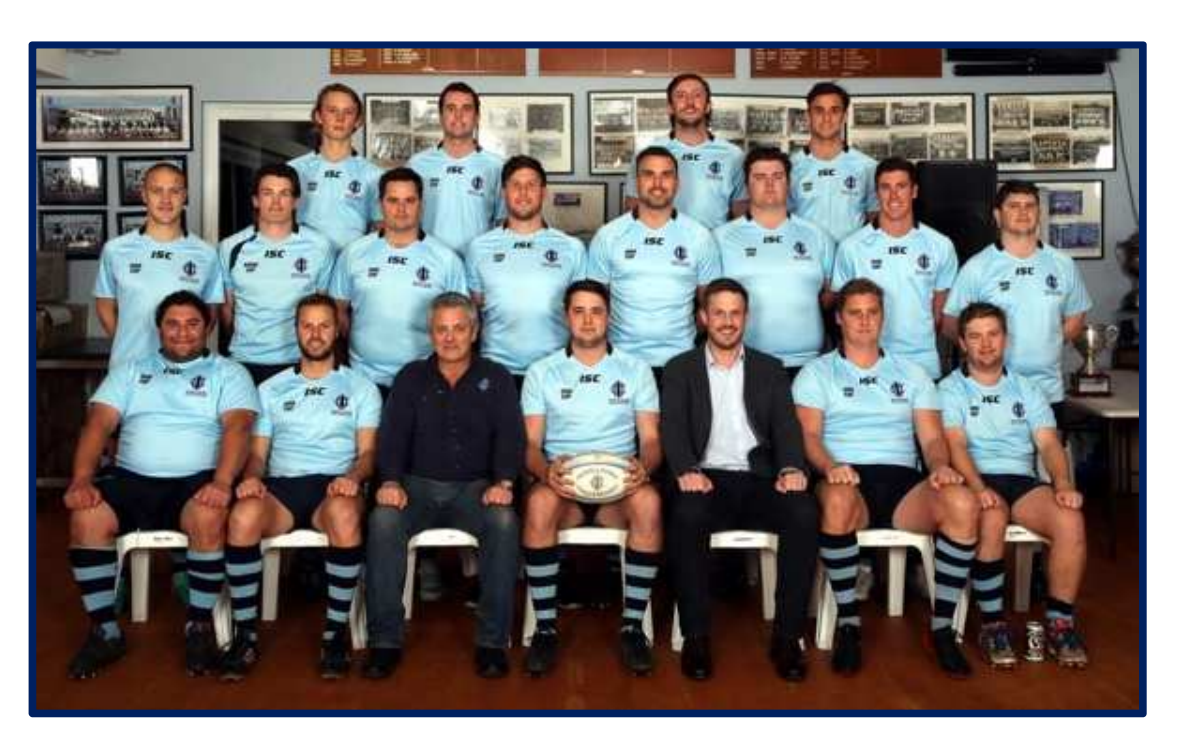
Judd Cup 2019